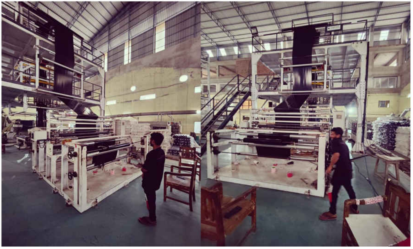
26th ANNUAL REPORT-2023-24